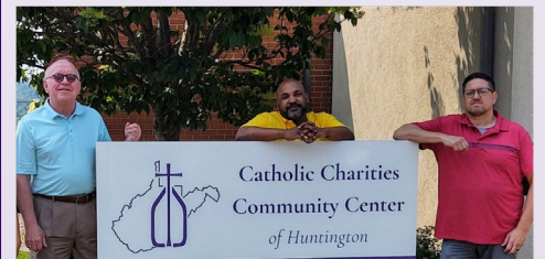
Catholic Charities Community Centers have opened in Charleston, Parkersburg and Huntington.

In Wheeling, we operate our new Hospital Transition Program in partnership with WVU Medicine Wheeling Hospital. We have seen great success in providing a supportive transition for high-risk patients as they are discharged from the hospital.