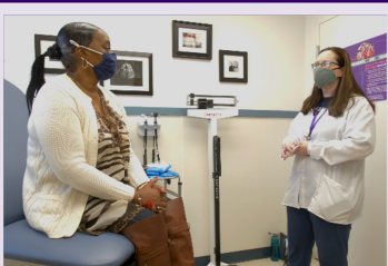
Catholic Charities West Virginia operates a Hospital Transition Program in partnership with WVU Medicine Wheeling Hospital.

In Morgantown, Catholic Charities has joined Hazel's House of Hope, a social service hub housing multiple non-profit organizations. We are thrilled for this opportunity to influence a model of collaborative services that truly move people out of poverty.