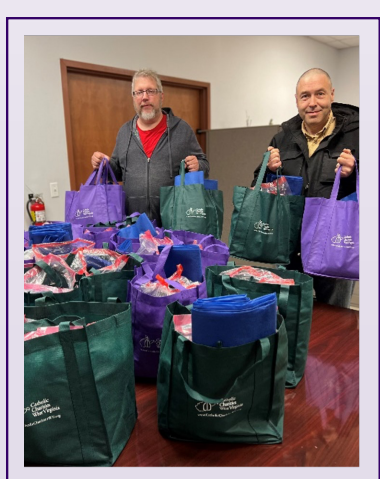
Catholic Charities West Virginia distributes "Matthew 25 Bags" for those experiencing homelessness.

To better demonstrate care and concern for the many individuals experiencing homelessness, the Catholic Charities West Virginia (CCWVa) Western Region has begun filling tote bags with personal care items and distributing the bags in Charleston, Huntington, and Parkersburg.