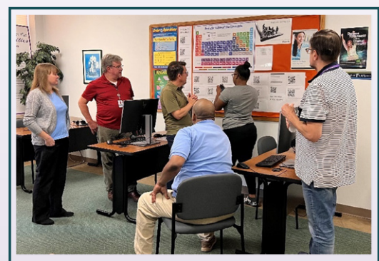
Catholic Charities' Adult Education Program provides free classes to any adult who wishes to further his or her education or gain new skills.

Research shows not only does adult education have a positive impact on learners' employability and income; it also helps individuals acquire a renewed sense of self as well as an improved quality of life.