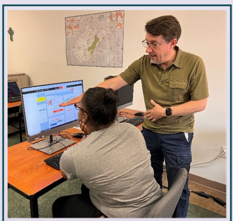
Catholic Charities' Adult Education Instructors work one-on-one with learners to provide customized instruction.