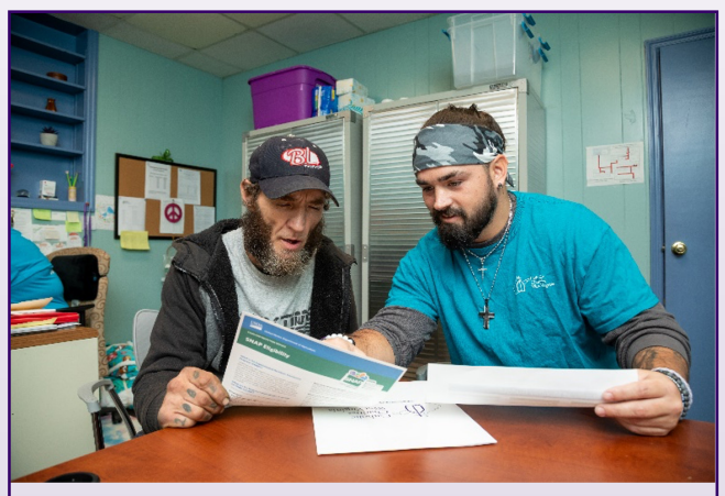
Catholic Charities case managers provide support for clients working to meet their goals

Through our case management program, we work with clients to understand the underlying cause of need, and we provide resources to help. Whether it is patients being discharged from hospitals, adult learners in recovery from substance use disorder, or the pregnant mom needing help; case management is a journey of hope and transformation.