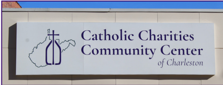
Catholic Charities West Virginia opened the Catholic Charities Community Center of Charleston in partnership with the Basilica of the Co-Cathedral of the Sacred Heart