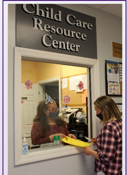
The Catholic Charities Child Care Resource Center assists families with the cost of child care

The Mission of Catholic Charities West Virginia: Guided by God's love, Catholic Charities collaborates with community partners, parishes, and families to provide caring and compassionate services to people in need and work toward lasting and meaningful change.