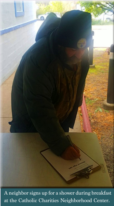
A neighbor signs up for a shower during breakfast at the Catholic Charities Neighborhood Center.