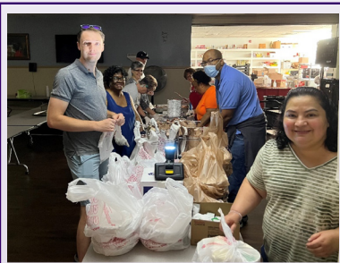
Diocese of Wheeling-Charleston staff members pack meals at the Catholic Charities Neighborhood

helped pack meals for our meal delivery service which provides home-delivered meals to those who are homebound or unable to leave their homes."