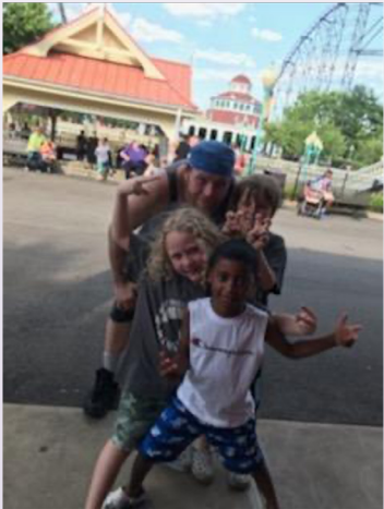
Participants in the CCWVa Relatives as Parents Program enjoyed a day at Kennywood in July.

While for many of us, summer is a time of relaxation or perhaps a vacation, for some families this is not the case.