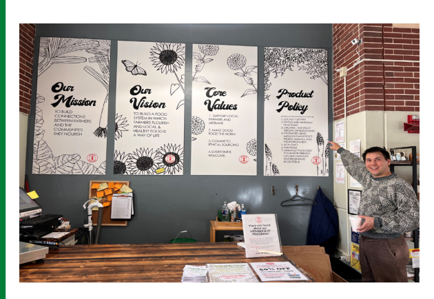
CCHD is providing funding to Grow Ohio Valley who sees local food and sustainable agriculture as an economic driver for West Virginia