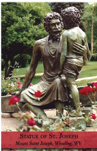
STATUE OF ST. JOSEPH Mount Saint Joseph, Wheeling, WV

The Latin-language version of the seven invocations is: "Custos Redemptoris" (Protector of the Redeemer); "Serve