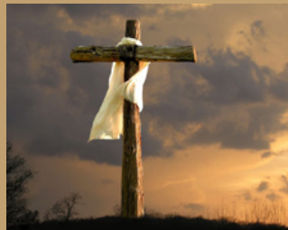
Good Friday Page 3