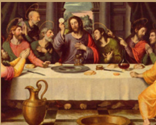
Holy Thursday Page 2