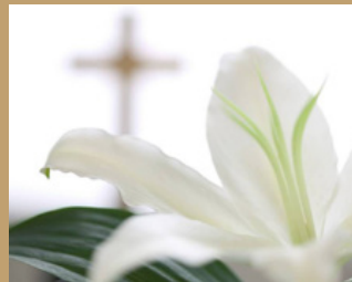
Easter Reflection Page 4