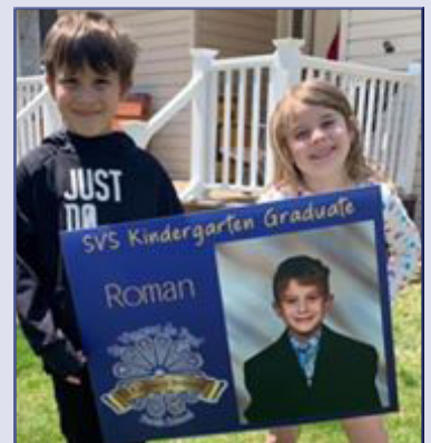
ST. VINCENT DE PAUL SCHOOL WHEELING

Integrated Digital Media classes created Split Personality images, using multiple photographs of themselves and their knowledge of graphic design.