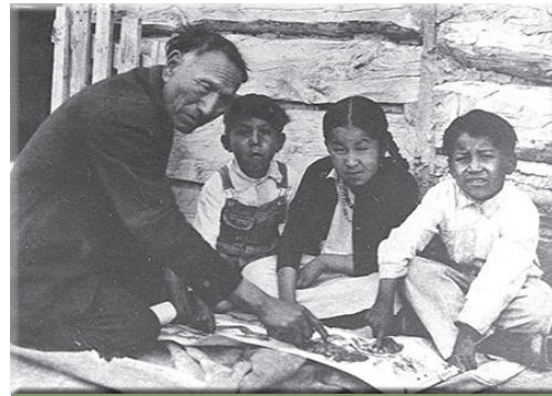
BLACK ELK CATECHIST WITH THREE CHILDREN

he became a missionary disciple of life, radiating the healing love of Jesus into a broken world.