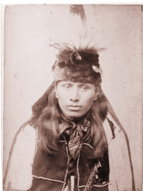
Black Elk YOUNG NICHOLAS BLACK ELK

Servant of God Nicholas Black Elk is an example of discipleship for our times, though he lived the faith