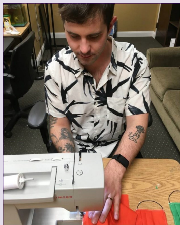
SustainU, one of Coalfield's social enterprises, pivoted during the pandemic to sew custom masks.

Coalfield Development Corporation is a business incubator of social enterprises in Wayne County. Since 2010, they have been striving to employ would-be coalminers and other unemployed people in diversified work opportunities. Following the 33-6-3 business model, trainees work for 33 hours each week, are in the classroom for 6 hours, and receive professional and personal development for 3 hours each week. This model, developed by Coalfield, speaks to the fact that people sometimes need more than a job to keep themselves on track. Incentivizing education and personal development so concretely has led to very successful graduates of the trainee program.