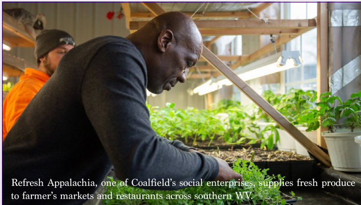
Refresh Appalachia, one of Coalfield's social enterprises, supplies fresh produce to farmer's markets and restaurants across southern WV.

In the Diocese of Wheeling-Charleston, the Catholic Campaign for Human Development (CCHD) is housed within Catholic Charities West Virginia. With both organizations having missions to create positive change for people living in poverty, our work compliments each other and is motivated by love.