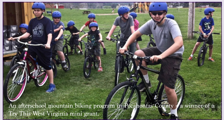
An afterschool mountain biking program in Pocahontas County - a winner of a Try This West Virginia mini grant.

Both of these organizations are doing vital work and creatively addressing issues that have been around for decades. Coalfield and Try This are working for the good of people in West Virginia.