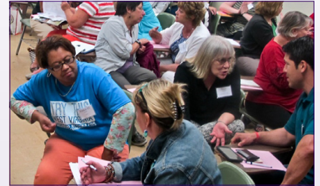
A pre-COVID community organizing workshop hosted by Try This West Virginia. They are brainstorming ways to change policy and organize projects.

and eating practices coupled with policy work to combat health issues including obesity, heart disease, and diabetes. This statewide network of movers and shakers gives local communities the opportunity to learn