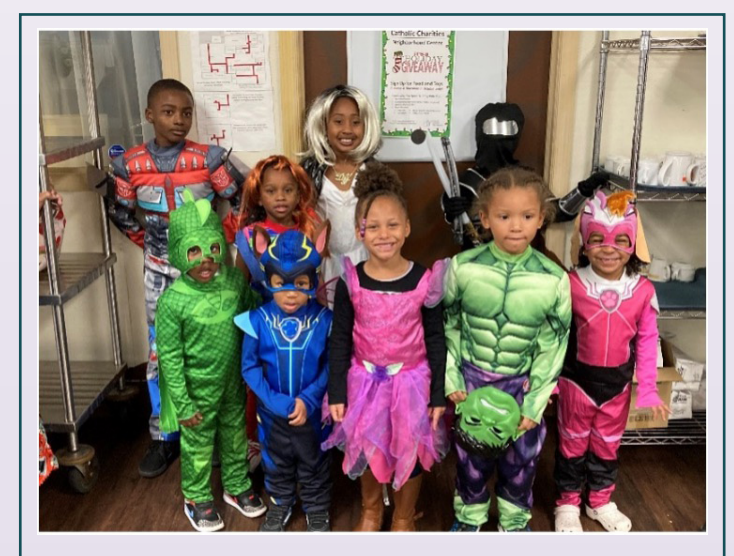
Families from Catholic Charilies' Relatives as Parents Program gather for a Halloween party.

CCWVa's Relatives as Parents Program (RAPP) serves families in which caregivers other than the biological parents are raising children. We often see grandparents or aunts or uncles stepping in to raise children when their biological parents are not in a place to do so.