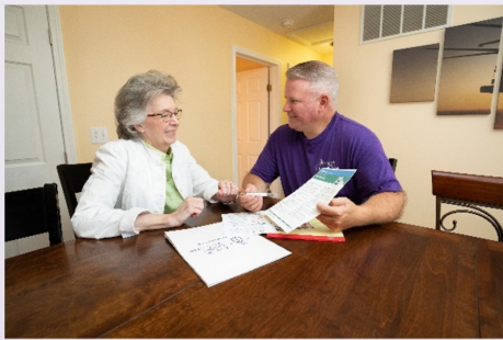
Catholic Charities West Virginia provides emergency rental and utility assistance to those in need.

As the days get shorter and the nights get colder, many of our sisters and brothers are struggling. Catholic Charities West Virginia provides the services people need to experience safety and security.