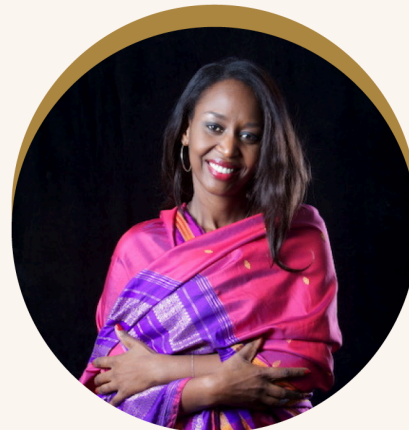
BEST SELLING AUTHOR AND RWANDAN GENOCIDE SURVIVOR

Scan the QR code for more information and to register or visit https://tinyurl.com/immaculee-retreat