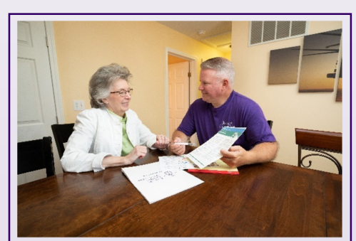
Catholic Charities West Virginia provides emergency rental and utility assistance to those in need.

As the days get shorter and the nights get colder, many of our sisters and brothers are struggling. Catholic Charities West Virginia provides the services people need to experience safety and security.