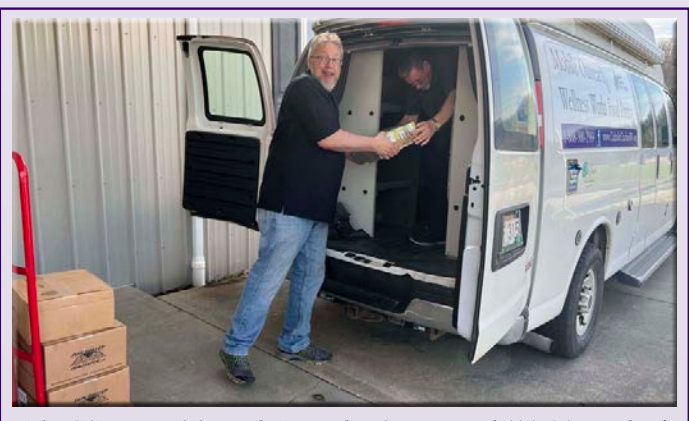
The CCWVa Mobile Food Pantry distributes around 115,705 pounds of food to approximately 275 households every month.

In addition to limited access to food, the higher prices of healthier foods often leave low-income families with little