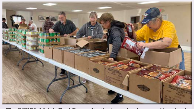
The CCWVa Mobile Food Pantry distributions take place monthly at local community centers and churches with on-site support from volunteers.

To address the needs of low-income families in rural and isolated communities, Catholic Charities West Virginia (CCWVa) created a Mobile Food Pantry – a mobile outreach van that travels to remote areas. In addition to providing food, the Mobile Food Pantry also provides nutritional and educational information as well as support and further resources.