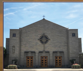
ST. JOSEPH THE WORKER PARISH 11:00AM

225 S. Queen Street, Martinsburg Sites.Google.com/site/stjosephwv